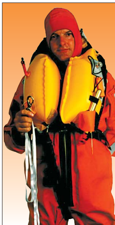
MK28WB General Assembly